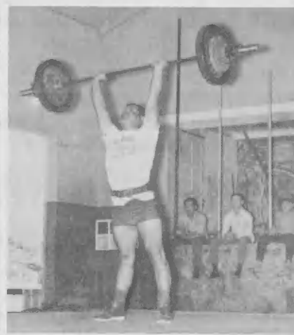
Weight-lifting at Noord